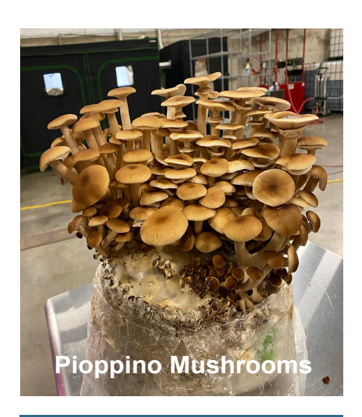
In 2022, Katie and her husband Ryan opened Dolina Farms, which specializes in multiple varieties of mushrooms.

The fresh mushrooms that don't sell get dehydrated. This opens up another market for Dolina Farms. After a mushroom harvest, the mushroom blocks are broken down and are then used in their garden. They plan to start selling mushroom compost in the near future. "Our goal is to capitalize where we can and limit our waste to the best of our abilities" says Ryan.