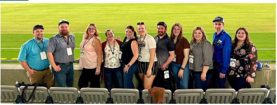
Oregon YF&R and Farm Bureau members at the 2023 American Farm Bureau Fusion Conference in Jacksonville, Florida.