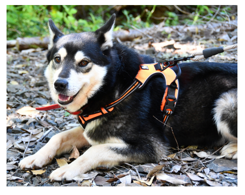
Ripley, the 2022 Oregon Farm Dog of the Year, guarding reindeer at Timberview Farm in Lane County.

OAEF's judges will review all applications from OFB members that were received by April 1st. Each application required answers about the dog's responsibilities and demeanor along with a photograph of the dog on the farm. Judges use the application information to select